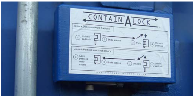
Contain – A – Lock® in use