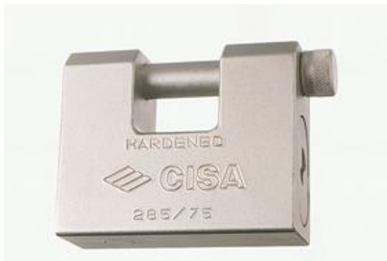
Supplied with CISA 285/75 padlock