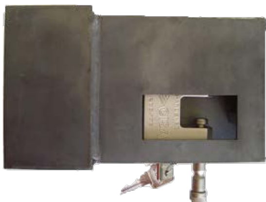
High Security, heavy duty locking system