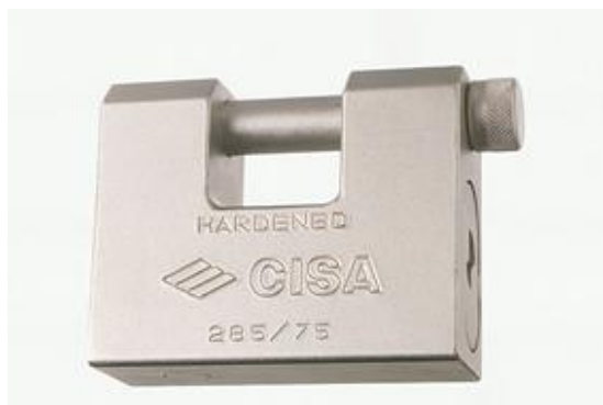
Supplied with CISA 285/75 padlock