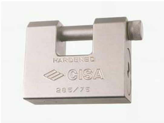
High security, insurance rated padlock